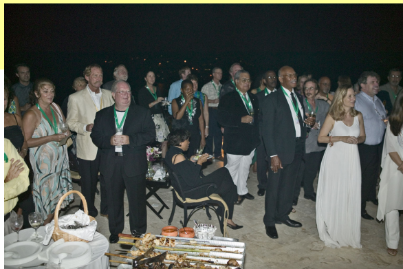
2006 CFVI Angel Reception

All CFVI's Angels for 2007 are invited to be honored at a gala evening of celebration, the Angel 2007 Spring Reception