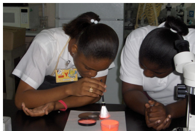
Students at Central High School reap the benefits of a 2005 Anderson Teacher Grant