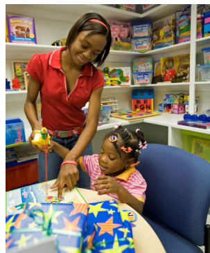
TFC Center 's Library

Please contact the TFC Center at 777-0990 for more information.