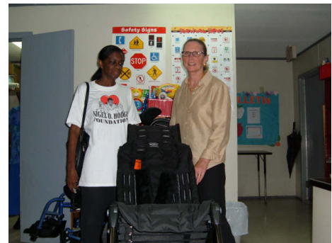
Donation of multi-functional wheelchair from the Nigel O. Hodge Foundation Fund

For all the support from our friends and donors, CFVI is deeply appreciative!