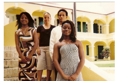
First Place Laws of Life winners from St. Croix Central High School