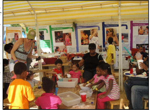
Volunteers, parents and children interact at play-station in the LAP Tent during St. Croix Ag. Fair

On February 13, 14 and 15, CFVI was a sponsor of the Leadership in Action Program (LAP) tent at the St. Croix Agriculture and Food Fair . Hundreds of parents and children visited the tent and participated in activities such as making play dough, building with blocks, pipes and recyclable objects, and playing in a "sandbox" filled with birdseed. Child care professionals were on hand to talk to parents and provide them with materials from the Born Learning campaign. LAP is a results-based program with 30 USVI community leaders, who are working towards aligning goals and strategies to ensure that all children in the Virgin Islands are healthy and prepared to succeed in school. The Leadership in Action Program is an initiative of the Governor's Children and Families Council, funded by CFVI in partnership with the Annie E. Casey Foundation, the Government of the Virgin Islands, local businesses and private donors.