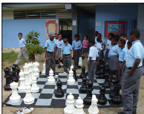
Students at Ulla F. Muller Elementary School check out giant chess board on December 21, 2009.

In November 2009 CFVI awarded Anderson Teacher Grants directly to 22 teachers from 14 public schools in the Territory for initiatives in music, the environment and arts. Through a $1,000 grant, the Ulla F. Muller