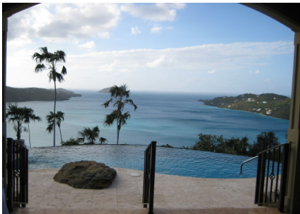
View of Magens Bay from Estate Sherpenjewel taken March 14, 2009.