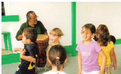
Left, children performing exercise to rhythm at Madrasatun Daycare; right, students at Prophecy Academy.

Carabana Ensemble Theater Company of St. John is introducing students to the world of art while simultaneously linking the arts with academic disciplines, providing a well-rounded student prepared for kindergarten to first grade.